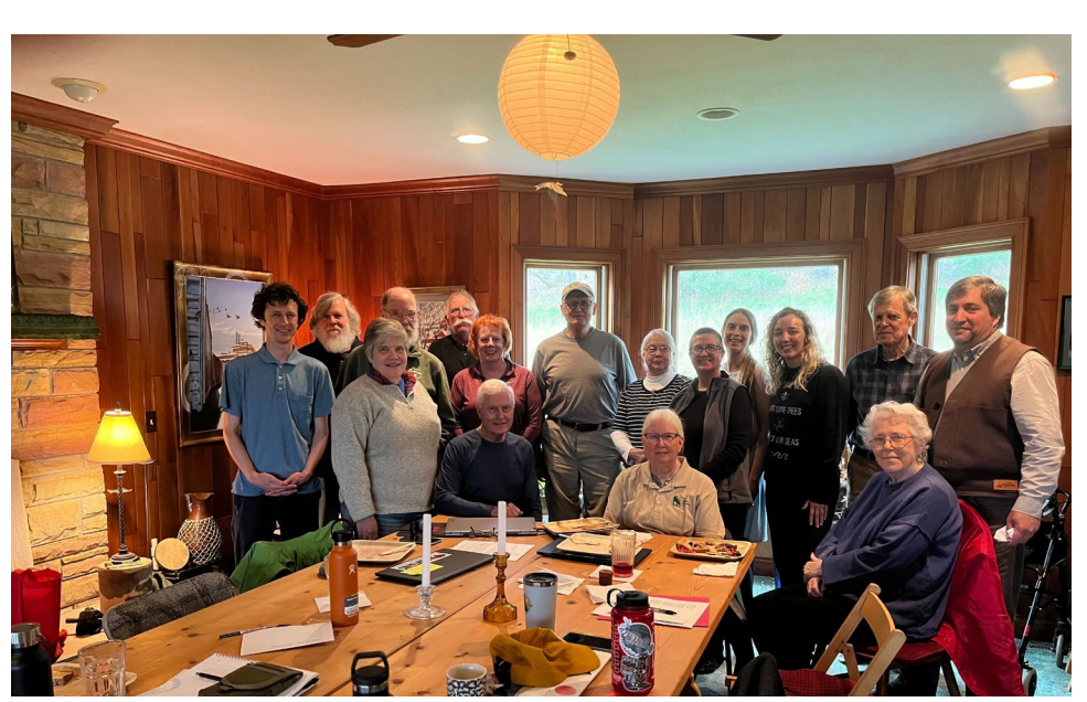
April 2023 West Virginia Highlands Conservancy board meeting held at Saranam Retreat Center.

We had a brief and inconclusive discussion of the possibility of making The Monongahela National Forest Hiking Guide, Making a