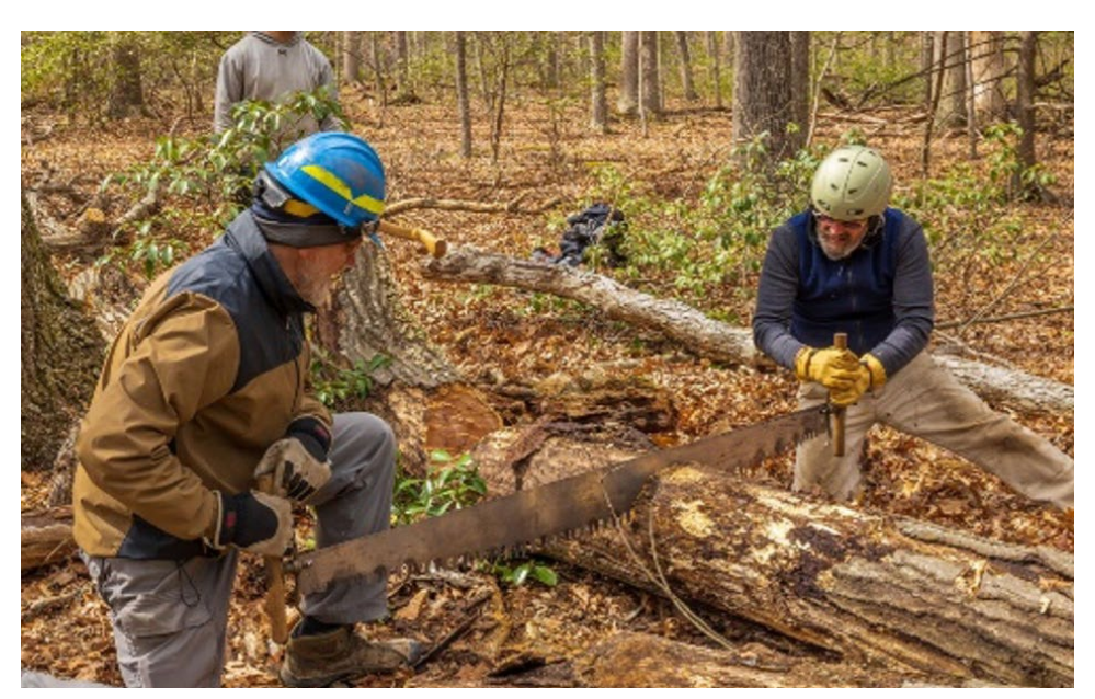
Tackling a fallen log with a traditional crosscut saw.

expect to take on more challenging jobs deeper in the wilderness. The first two-day training for the trail maintenance team was held in late April. Dolly Sods trails have a lot of issues, so we expect the crew to be working on a frequent and ongoing basis throughout the season.