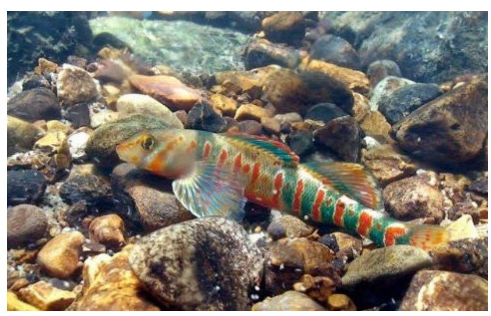
(Todd Crail/University of Toledo)

On April 25, 2023, the West Virginia Highlands Conservancy, alongside a coalition of conservation groups, <u>notified</u> the U.S. Forest Service of the intent to sue over the agency's failure to protect endangered species from the harmful effects of coal hauling in the Monongahela National Forest.