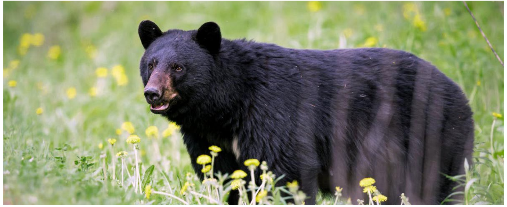
(West Virginia Division of Natural Resources)

The Appalachian Trail Conservancy has a new policy in place requiring thru hikers bring a bear canister with them as one of their vital items. The Appalachian Trail has become increasingly popular in recent years with a massive influx of visitors exploring one of the longest most beloved trail systems in the U.S. However, a large majority of the trail is populated by black bears and the surplus of visitors has led to an increase in human and bear interactions.