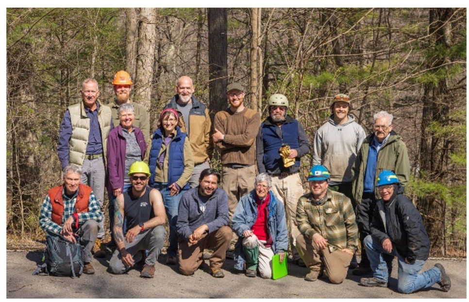
Members of the crosscut sawyer team after a successful day in the field.

The Wilderness Stewards used the winter to huddle regularly with the Forest Service and develop plans for the upcoming season. This led to the launching of both a new trail maintenance team and a specialized crosscut sawyer team. This will significantly expand the fieldwork capabilities of the Stewards and have a tangible positive effect