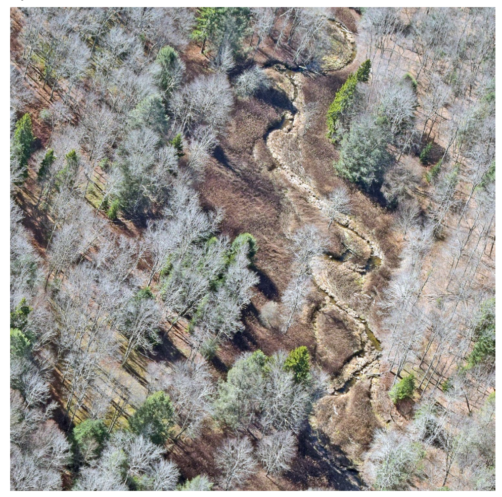
Wetlands along Buffalo Fork in the Greenbrier Southeast Project area.

With the assistance of <u>Appalachian Mountain Advocates</u>, the West Highlands Conservancy has asked a United States District Court to require U.S. Forest Service compliance with National Environmental Policy Act (NEPA) review requirements before proceeding with the Greenbrier Southeast Project, a Monongahela National Forest management proposal involving extensive steep-slope earth disturbance and commercial clearcutting in watersheds that support native brook trout and the endangered candy darter.